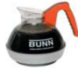
EASY POUR,(ORN) 2/CS