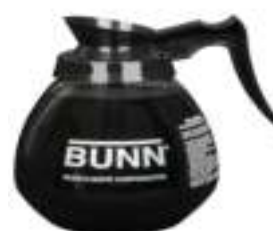
DECANTER,GLASS-BLK 12C 24/CS