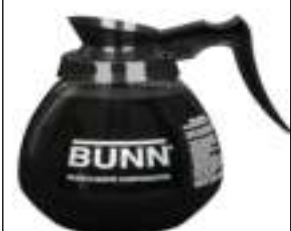
DECANTER,GLASS-BLK 12CUP 1PK