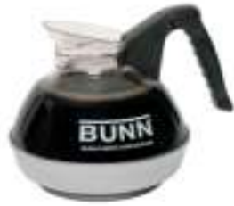
EASY POUR,(BLK) 2/CS