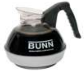
EASY POUR,(BLK) 12/CS