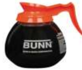
DECANTER,GLASS-ORN 12C 3/CS