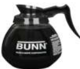
DECANTER,GLASS-BLK 12C 3/CS