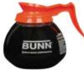
DECANTER,GLASS-ORN 12C 24/CS