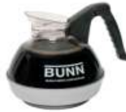
EASY POUR,(BLK) 6/CS