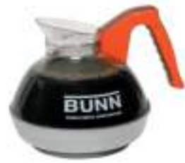
EASY POUR,(ORN) 6/CS