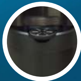
Removable Drip Tray