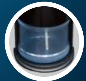
Unique Sliding Front Door